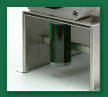
Sealed disposable container for toxic dust collection.