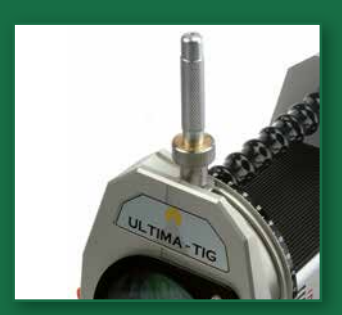
The tip may be flattened by 1/10 mm per point in a 90° position.