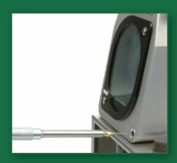
Easy to use combined electrode positioning and locking device.