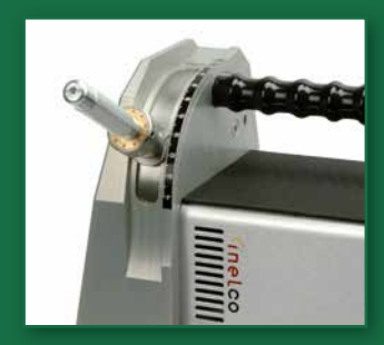
Grinding angle from 7.5 - 90° creates accurate electrode angles of 15 - 180°.

Motor: 110/220V, 50Hz · Motor yield: 380W Rpm: 8500/min · Grinding speed: 44 m/sec.